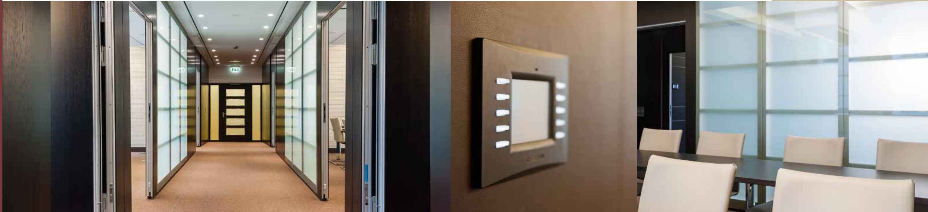
ATMOSPHERIC INTERIOR, STATE-OF-THE-ART TECHNICAL EQUIPMENT, UTMOST FLEXIBILITY.