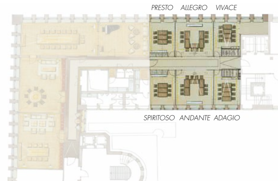
FOR FULL PLAN SEE INSIDE BACK COVER