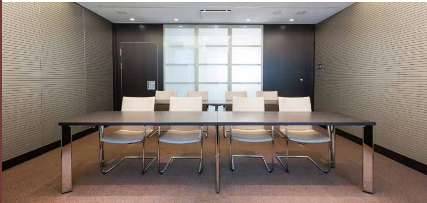
ATMOSPHERIC INTERIOR, STATE-OF-THE-ART TECHNICAL EQUIPMENT, UTMOST FLEXIBILITY.

Technical equipment: 55"/140 cm LCD monitors integrated into the walls