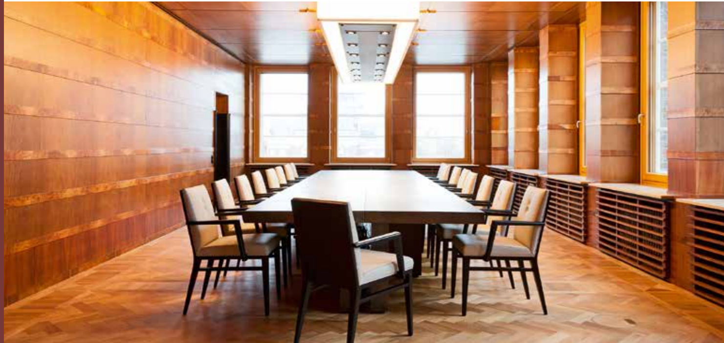
LEATHER-COVERED CONFERENCE TABLES AND CHAIRS, TOUCH PANEL CONTROLLED CONFERENCE EQUIPMENT – CLASSIC AND MODERN.